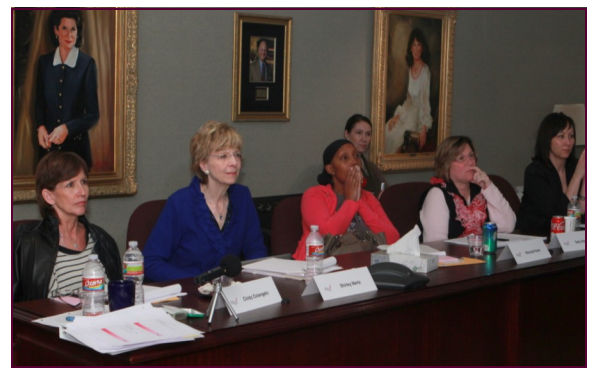
Women living with MBC participate in the Susan G. Komen for the Cure Metastatic Roundtable, January, 2012

These research investments reflect only part of our commitment to people living with MBC. In 2012, Komen held its first Roundtable to address the needs of those living with MBC. Komen also provides educational materials , conference support and Affiliate funded grants across the nation. Read about women living with MBC in our Chronicles of Hope Series on the Research and Scientific Programs page on komen.org .