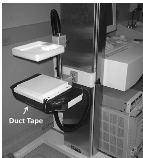
Original MBI Machine with Duct Tape